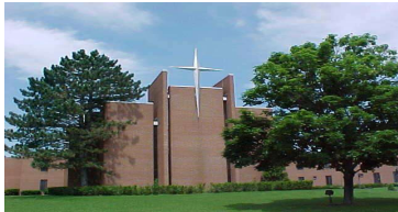
The Notre Dame Retreat House

Save the Date! September 10-12 Our Annual Women's Retreat