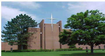
The Notre Dame Retreat House

This year's theme: Talkin' the Talk / Walkin' the Walk